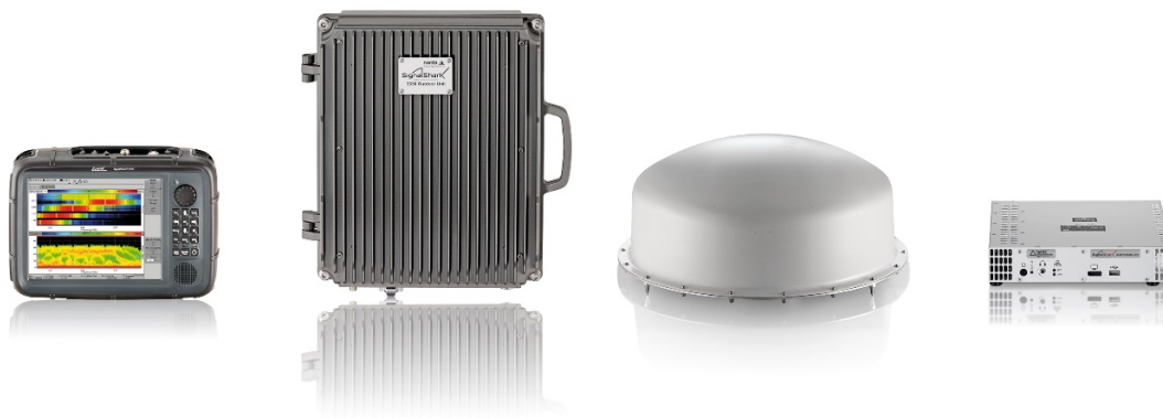
Narda SignalShark family in the variants (from left to right): Measuring Receiver Handheld, Measuring Receiver Outdoor Unit, Automatic DF Antenna ADFA, Measuring Receiver Remote

No installation site corresponds to the other; therefore, a general installation note can only have a recommendatory character and give hints. The actual execution of the installation at the place of use therefore requires precise planning and execution in order to obtain optimum DF results.