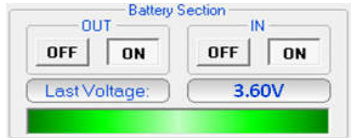
Fig. 4 - 8059-NSTS battery section