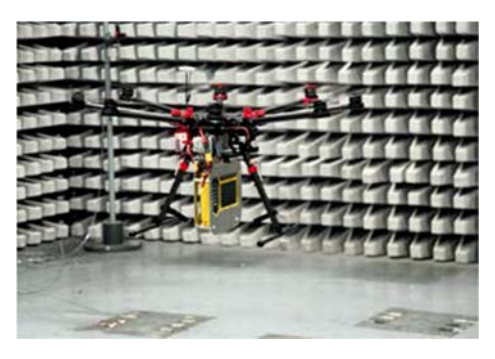
Figure 3: Drone in flight above the test turntable with active measuring device control during immunity testing (without isotropic antenna)

IMST GmbH has been active in the field of EMC, EMI, and radio frequency measurements for more than 20 years. The laboratory used to perform the measurements is DAkkS accredited (German Accreditation Agency) for all the above measurements. IMST GmbH is a member of UAV DACH (UAV governing body) and performs UAV DACH tests complying with §21d LuftVO for the accredited location.