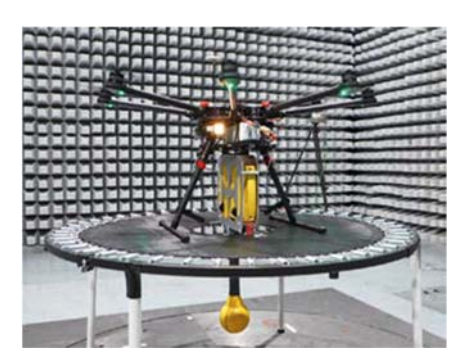
Figure 2: Drone on the start pod with antenna fitted

Other applications for this copter system are measurements on high tension cables or LF transmitters. The drone can be fitted e.g. with a Narda EHP-50 or Narda EHP-200A for this purpose. Both of these devices have optical interfaces that can be used to control the instrument. As they are also more compact, less work is needed to cope with the antenna because the E field and H field antennas are both integrated into the instrument.