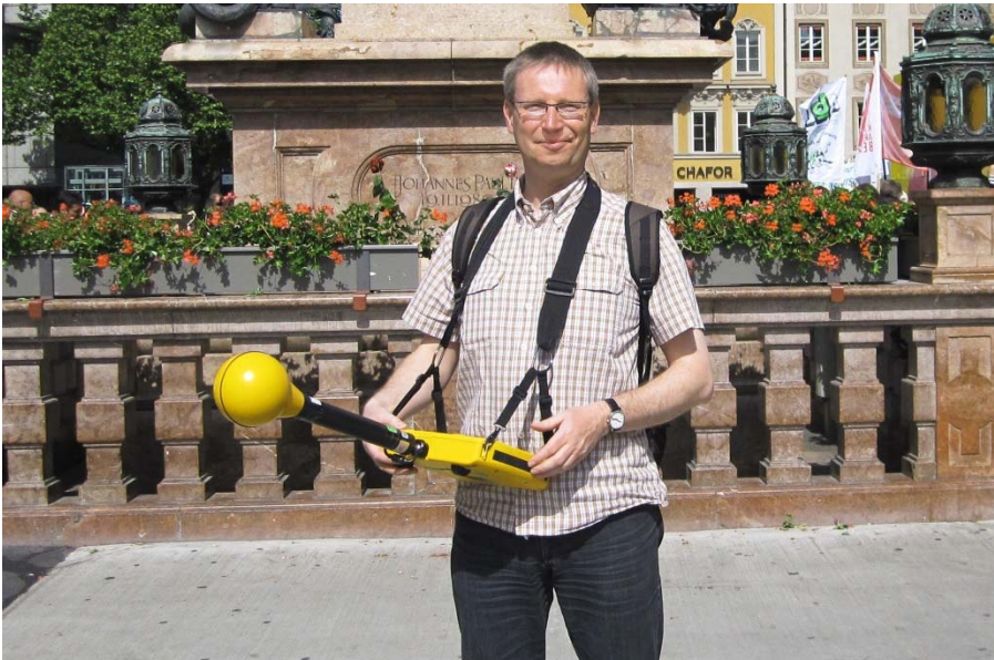
Application Note „SRM-3006- Reliably measuring actual HF immissions“

Immission measurement studies on the exposure of the general public to high frequency electromagnetic fields (HF EMF) have in the past been limited to examining individual wireless services and the wireless Internet. However, in everyday life we are surrounded by a much more complex mixture of a large number of different RF sources. As a result, questions about the actual total level of personal exposure are being raised more and more in public discussions on the subject. How high is the actual exposure at a given time and place? The SRM-3006 from Narda STS has proven to be particularly suitable for such demanding measurement tasks.