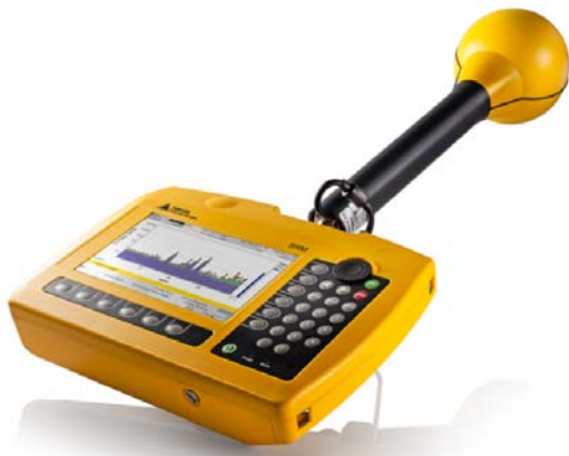
Figure 2: The SRM-3006 (Selective Radiation Meter) from Narda Safety Test Solutions used by Dr. Christian Bornkessel for the measurements.

According to Dr. Bornkessel, an internationally recognized expert in RF measurement, this instrument is in many respects ideally suited for precisely these measurement tasks, being both robust and easily handled. It allows efficient recording of several wireless services with different spectrums in a single measurement run. This powerful hand held instrument also boasts good sensitivity and its precise results – even in an inhomogeneous field – are easy to interpret.