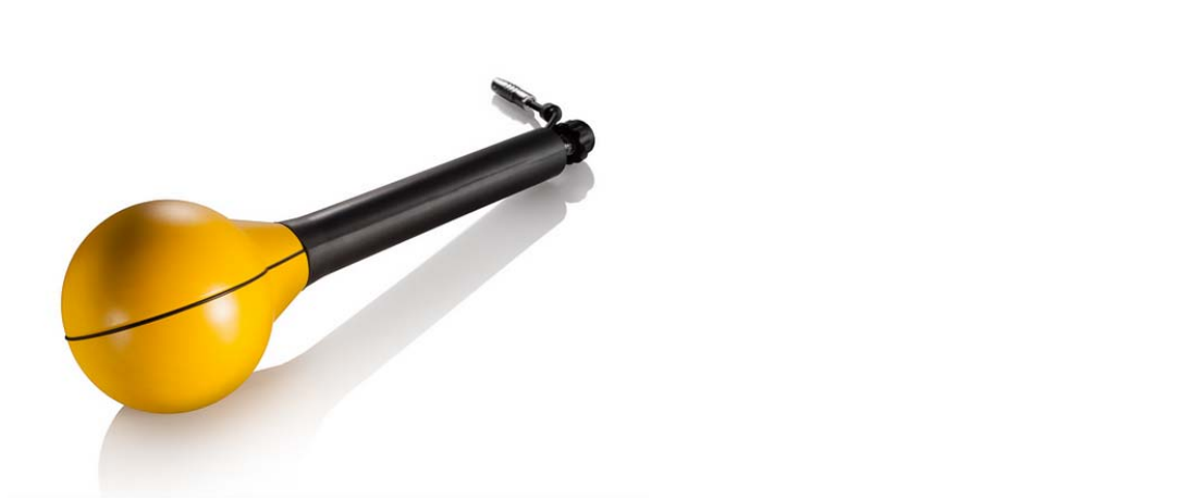
Figure 4: Three-axis antenna from Narda with isotropic directional characteristic for mobile services.

A three-axis antenna must be used for this measurement, because the correct measurement of the average immission can only be determined using an antenna with isotropic directional characteristics. There are three sensors inside this antenna, which are selected by the measuring instrument one after the other, so the antenna is quasi-isotropic. The SRM-3006 thus only needs one RF module to measure the three channels.