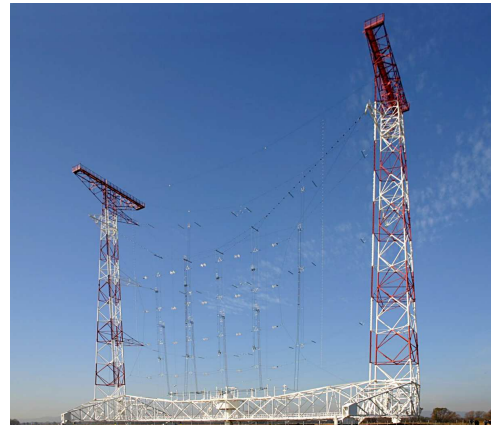
Short-wave curtain antenna station