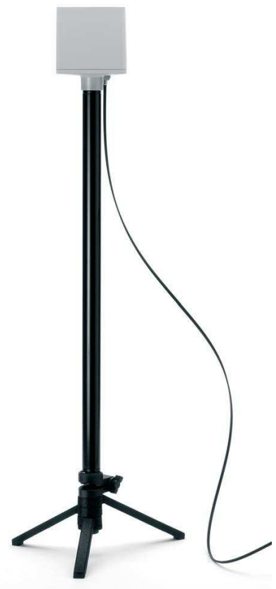
EHP-200 Isotropic E-H Field Analyzer installed on RF-transparent tripod and with optical cable connection

However, for the ionized regions are originated by the solar activity they're subjected to daily and seasonal changes from nearly total to no reflection at all; the reflection characteristics are also deeply changing in relation with the operating frequency. The broadcasters must therefore adopt such technical solutions aimed to ensure permanent service, like transmitting in different frequency bands during the day.