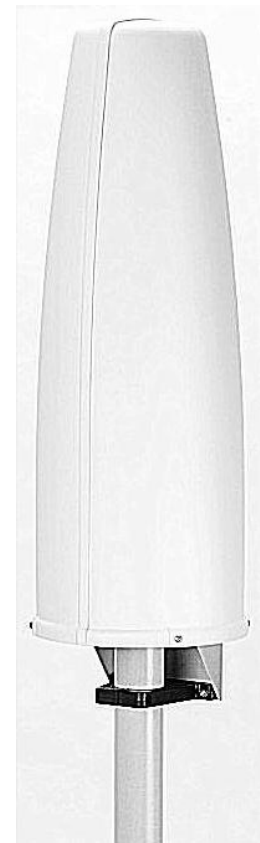
RF-transparent housing for outdoor installation