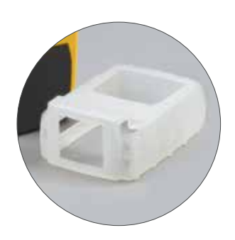
The Nardalert S3 casing is made of robust plastic. A silicone cover is also supplied as additional protection.

The overall concept using interchangeable sensors is innovative. As the device itself needs calibration less often than the sensor, it is sufficient and much cheaper to send off just the sensor for calibration. The calibration data are stored in the sensor and taken into account in the result by the device. This guarantees full precision at all times.