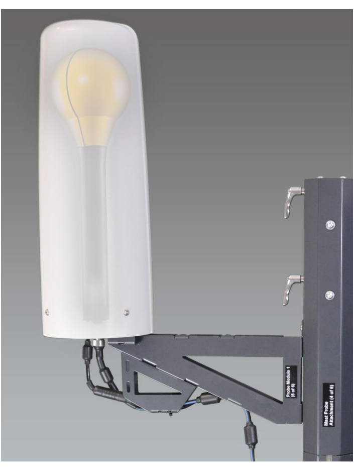
Fig. 3. Probe Module: Isotropic three axis EMF/EMC antenna in a radome, with antenna arm for mounting.

As the two antennas together cover a frequency range from 9 kHz to 6 GHz, they can be used to capture most of the radio services that are in common use today. This includes the classic broadcast radio and mobile communications services, as well as the newly allocated 3.6 GHz frequency band for the new 5G standard.