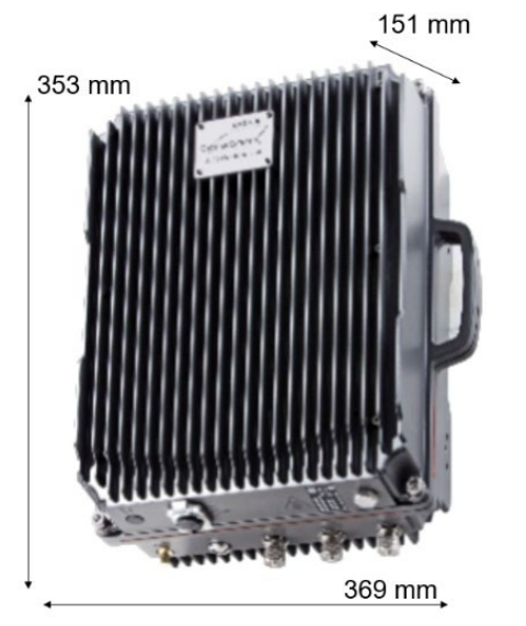
Fig. 2. SignalShark 3330 Outdoor Unit

All members of the SignalShark family are based on the same RF module. This module packs into the smallest space the sensitivity, dynamic range, and speed that were previously typical of large laboratory based measuring instruments.